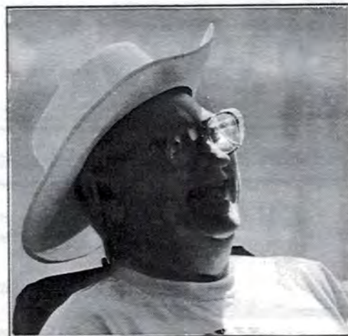
It's good to be president...

O.K. Let's get serious. An attitude that I would like to see in MWC goes along the line that there will be no losers at our battles. All will be winners, however some winners will be dryer than others. This is a