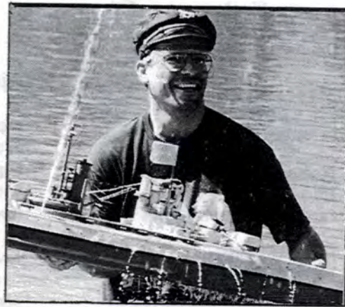
Editor gets critics' early reviews