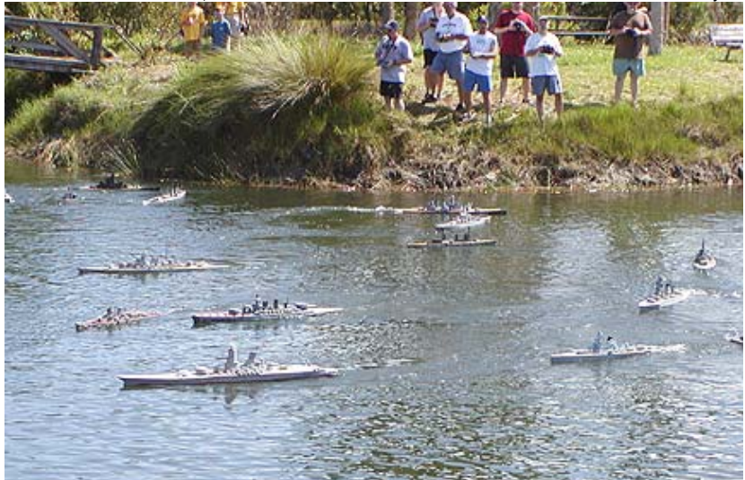
THURSDAY AM, ACTION OUTSIDE THE NARROWS...