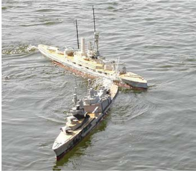
Get out of there Des Moines!